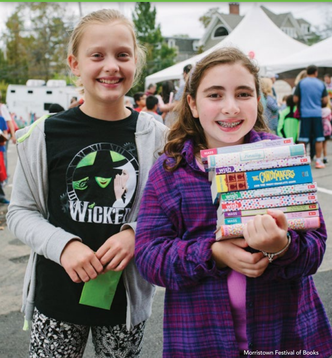
Morristown Festival of Books