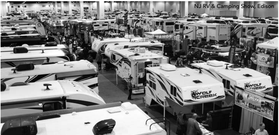
NJ RV & Camping Show, Edison

See the featured cover events on pages 24 & 26, and the camping show above on page 68.