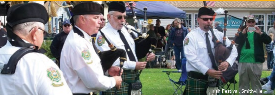
Irish Festival, Smithville