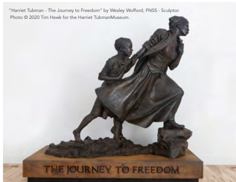
Harriet Tubman Museum, Cape May

Explore Cape May's legacy as a hub for the Underground Railroad and abolitionist activity, amid its Victorian splendor. Check out treasures and traditions in Atlantic City , the East Coast seaside gaming and resort capital. Head to Newtonville and Folsom for bonus museum, BBQ and wine time.