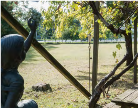
Moses D. Heath Farm, Middletown

Head to Red Bank and Middletown for rich history and a lively music and arts scene. Vibrant New Brunswick promises superb art and culture. See Somerville , where the iconic Paul Robeson grew up. Play golf in Scotch Plains , at the first Black-owned golf and country club in the US, then wine and dine in Plainfield .