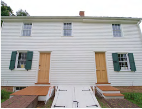
Peter Mott House, Lawnside

Travel to Lawnside : On land purchased by abolitionists in 1840, it was the first incorporated, self-governing Black municipality north of the Mason-Dixon Line. Stops in Camden and Burlington County reveal prominent Black historical presence and links to the Underground Railroad.