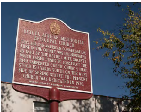
Bethel Church, Morristown

Trek intriguing museum collections and a variety of offerings and events in Newark, Jersey City and Tenafly . Visit Little Ferry and Morristown for groundbreaking landmarks created for Black residents in the 1800s. Nearby, sample tasty craft beer at Black-owned breweries in Montclair, Hackensack and Orange .